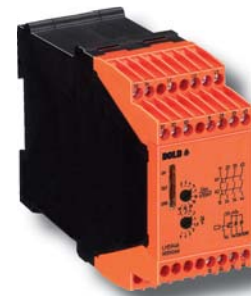
Standstill Monitor LH 5946

Cat. 4 / PL e according to DIN EN ISO 13849-I SIL CL 3 according to IEC/EN 62061 SIL 3 according to IEC/EN 61508, IEC/EN 61511 and EN 61800-5-2